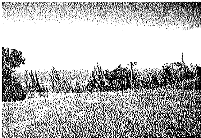
Opana radar site, Kawela, Hawaii, view looking north.

An even more significant aspect of the Opana radar story was the fact that the potential military implications of radar was now obvious for all to see. The use of radar gave the United States the important technological edge that was needed to redress the balance of power with Japan in the Pacific in 1942. In the months after Pearl